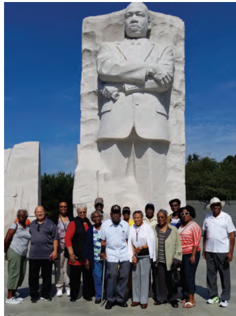
Martin Luther King, Jr. Memorial

History and Culture. Some members of the group enjoyed a photo opportunity at the Martin Luther King Memorial.