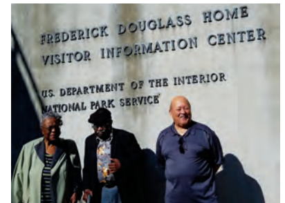
Frederick Douglass Home